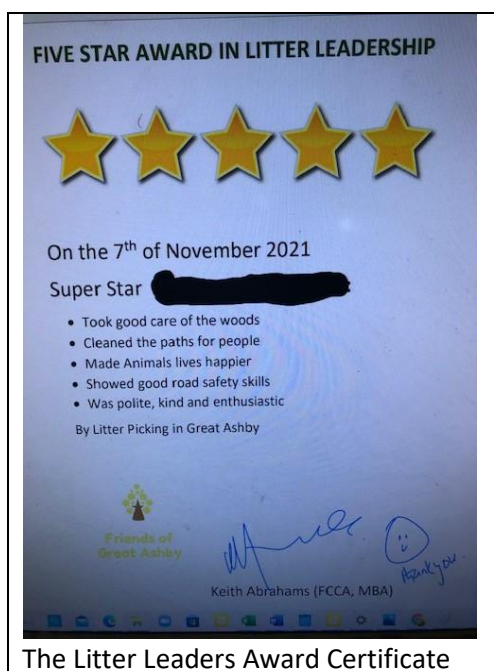
The Litter Leaders Award Certificate